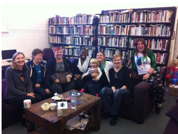
First Sunday Book Club

Members of Open House also organise a variety of social events from barefoot bowls to pool comps. Looking to the future, Open House is keen to broaden its range of voluntary facilitators so if you have a hankering for community activism, come along one Tuesday night at 7pm and join us. As always, Open House is hugely grateful to the Women's Library for allowing us a comfortable and convenient place to hold our meetings – thank you.