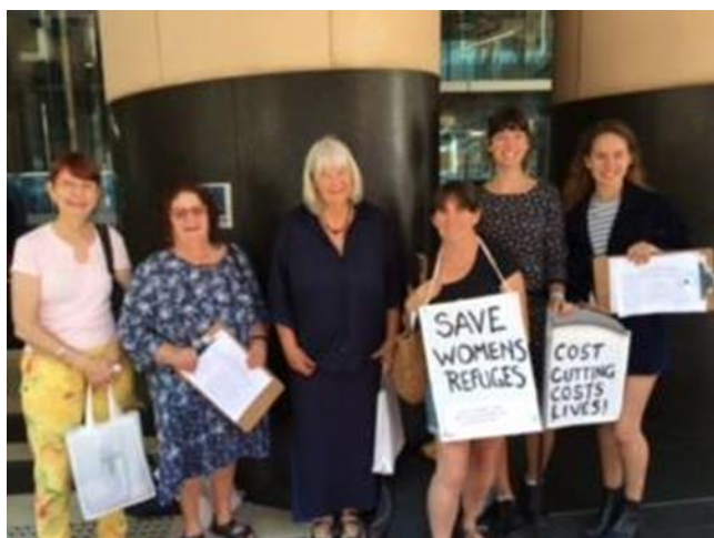
Campaigning to save the women's refuges