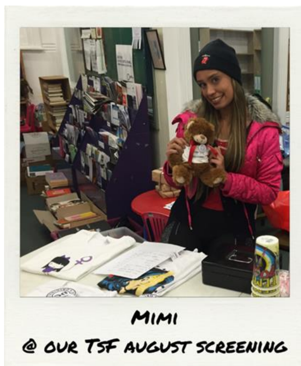
Sydney Feminist film screening at The Women's Library