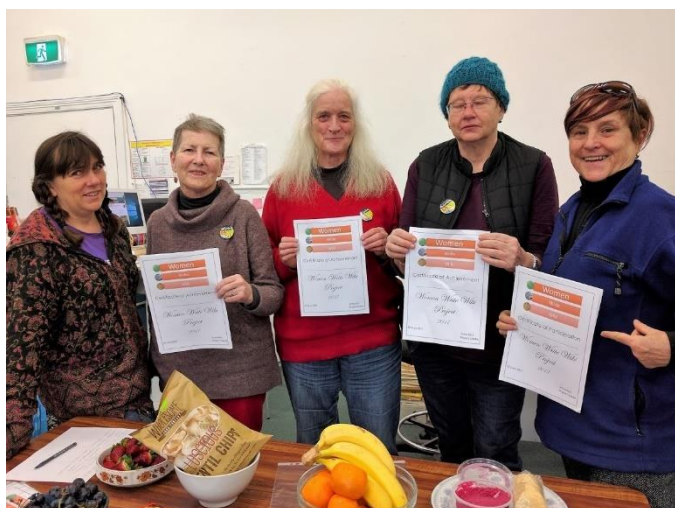
Women Write Wiki project participants receiving their certificates of achievement

https://www.facebook.com/womensmarchsydney/