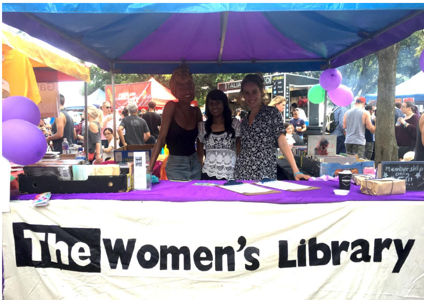
Some of our fabulous volunteers at The Women's Library Mardi Gras Fair Day Stall 2017