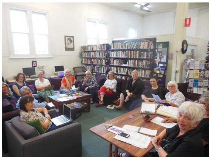
The Edna Ryan Awards Committee meeting at TWL

https://www.facebook.com/ednaryanawards/