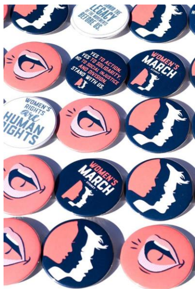
Women's March Sydney.