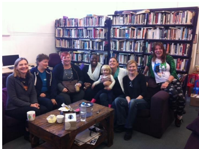
First Sunday Book Club