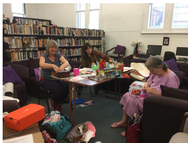
Art therapy on Monday at TWL